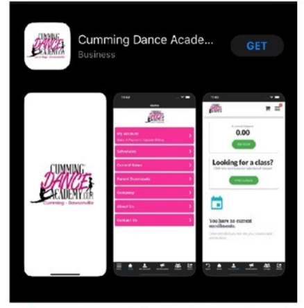
Access everything from your phone!